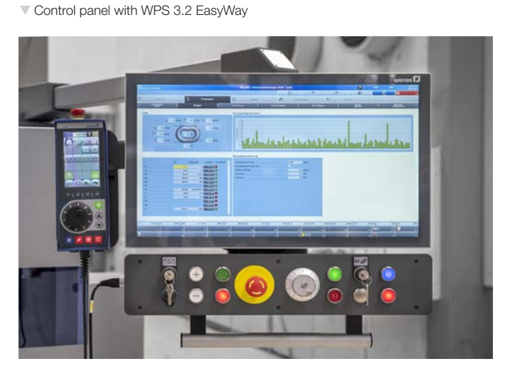
WAFIOS Series KER x.2 Chain Bending Machines 3