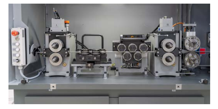
Our Accomplishments for your Benefit

Feed and straightening unit with feed control