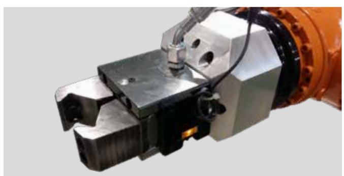
A Power Gripper

High production output and a long service life will save money and shorten the amortization time of your investment.